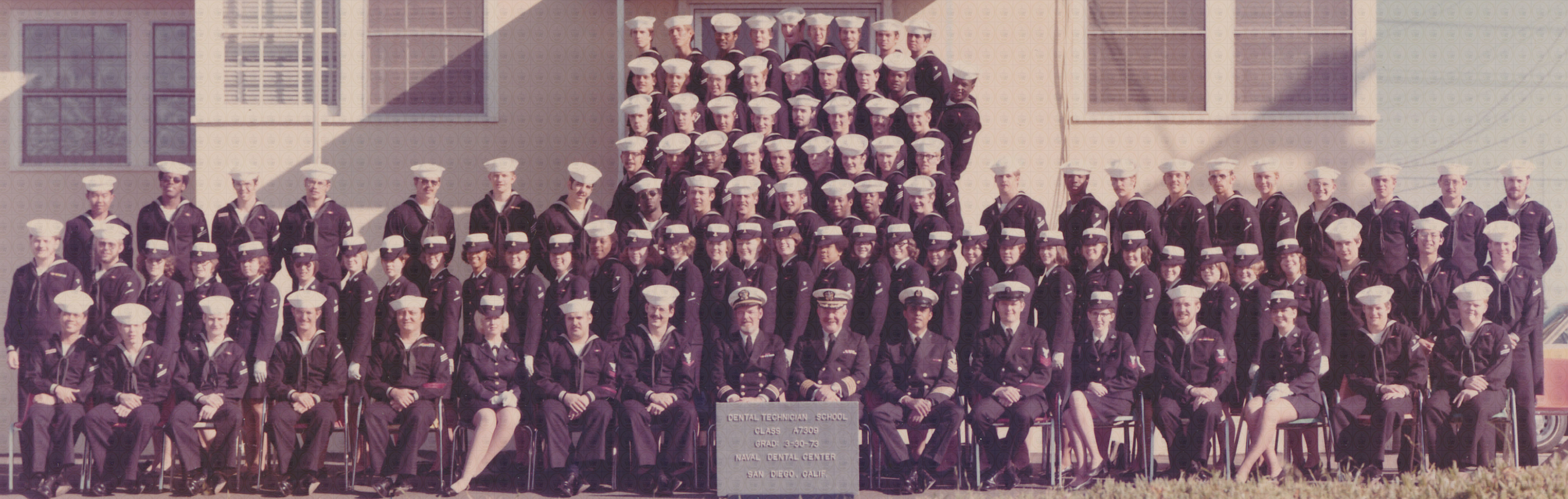
DENTAL TECHNICIAN SCHOOL CLASS 77308 GRAD: 3-30-73 NAVAL DENTAL CENTER SAN DIEGO, CALIF.